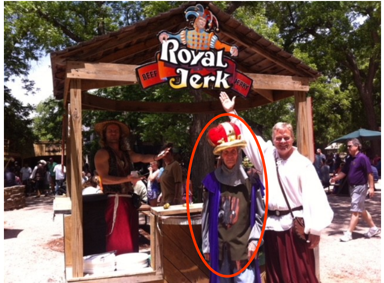
“King Rocket 88” WHO IS THIS IN THE RED CROWN & ROYAL ATTIRE?